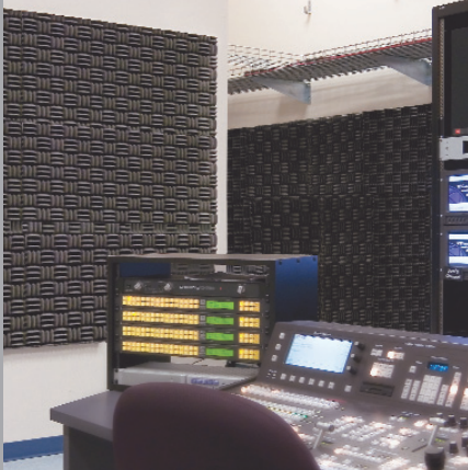
SONEX® Classic Panels in charcoal colortec used in the control room of a broadcast facility