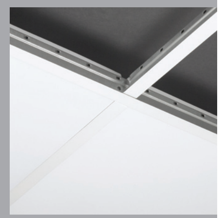
SONEX Clean Ceiling Tiles

2601 49th Avenue North, Ste. 400 Minneapolis, MN 55430 Toll-Free 1-800-662-0032 sales@pinta-acoustic.com www.pinta-acoustic.com