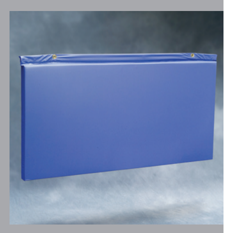
SONEX Clean Baffles