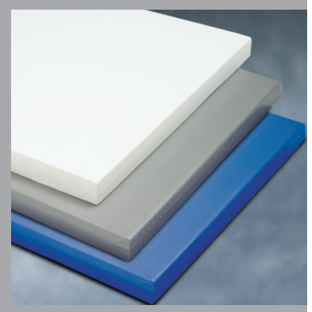
SONEX Clean Panels